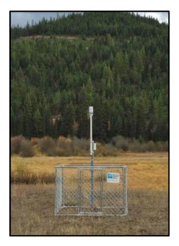
Figure 3. Mesonet station.

♦ Dead zones in AT&T cell coverage exist throughout the state, which limits potential Mesonet station locations.