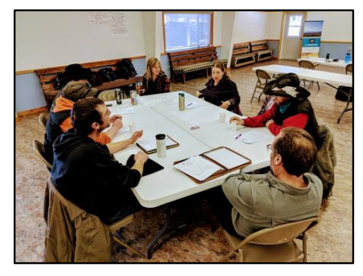
Figures 4 and 5. Clyde Park breakout discussions.